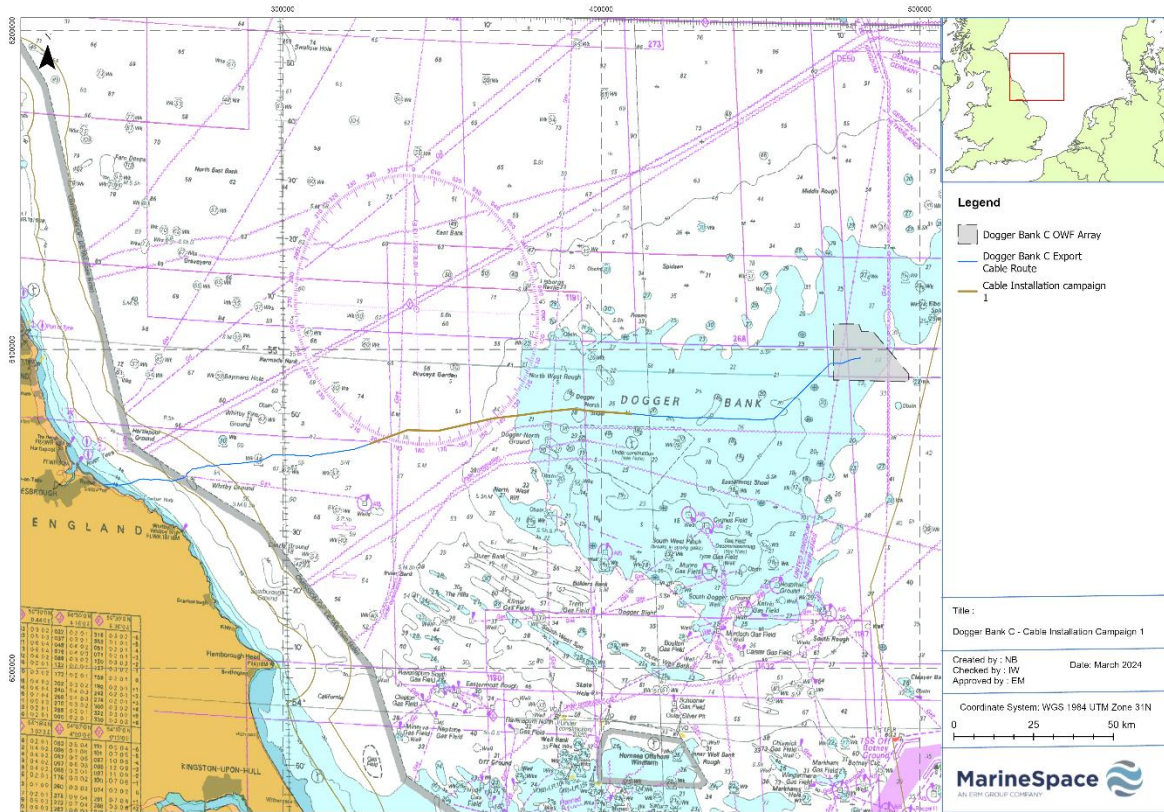
Figure 1: Dogger Bank C Cable Installation Working Area, Campaign 1 Overview (KP91 – KP177)