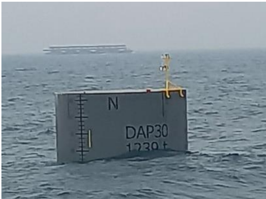
Figure 3: Monopile showing temporary Aid to Navigation Marking