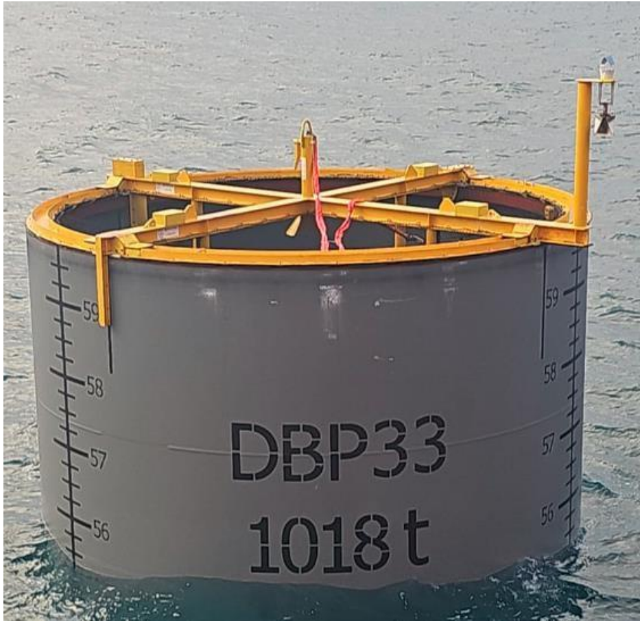
Figure 2: Monopile showing temporary Aid to Navigation Marking